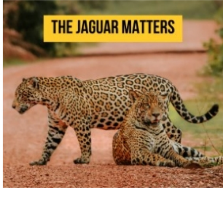
THE JAGUAR MATTERS